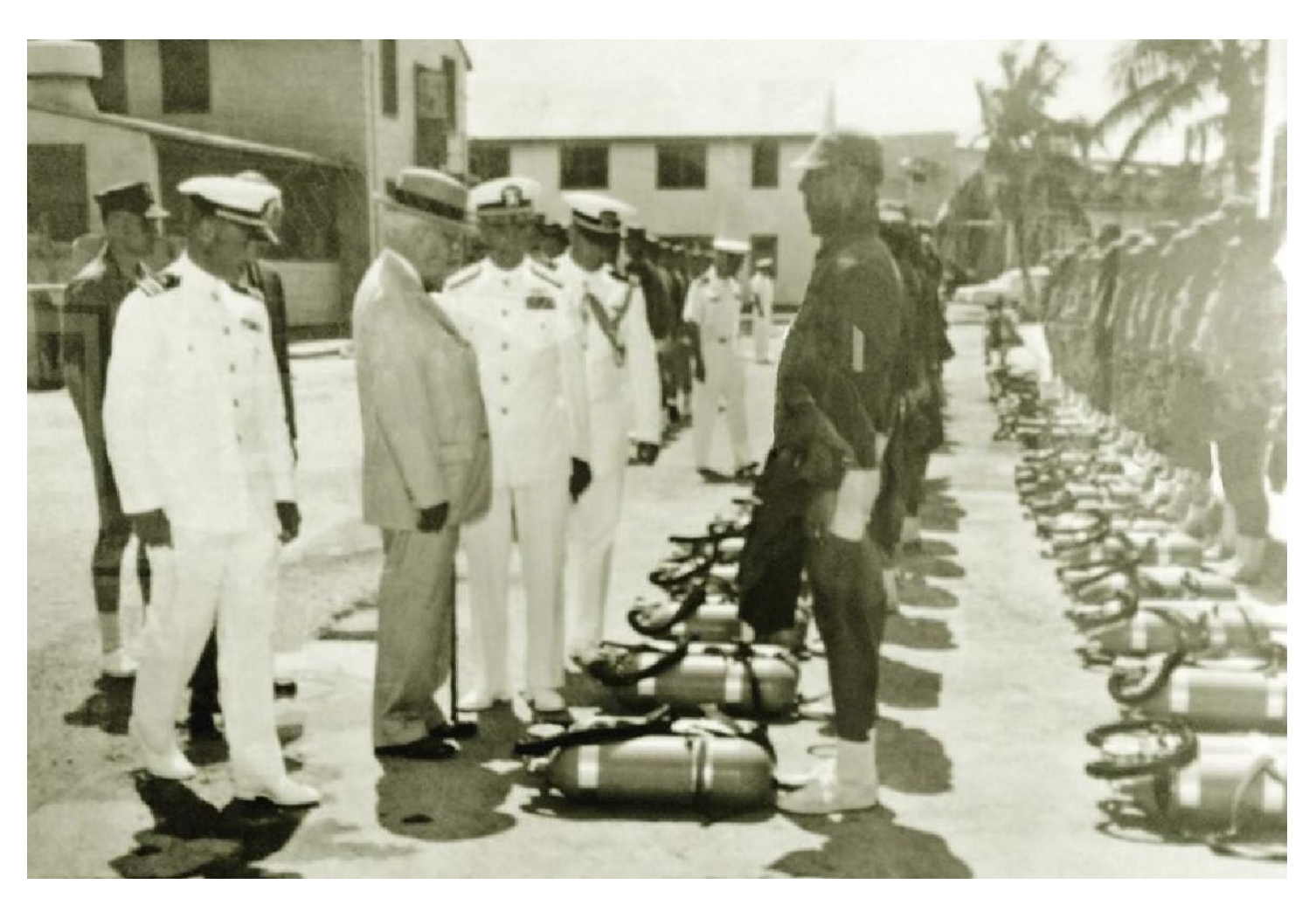
Truman visits Underwater Swimmers School